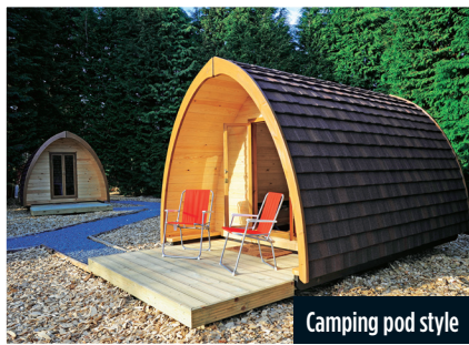
Camping pod style