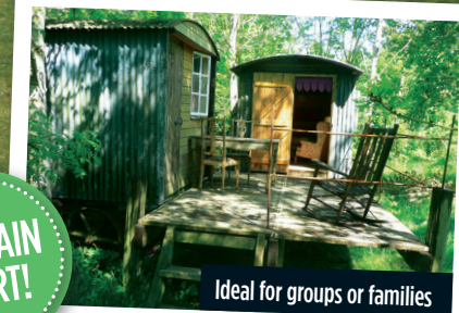
Ideal for groups or families

Happy Days Retro Vacations, East Dorset Book yourself a kitsch camping staycation at this collection of vintage Airstream caravans. Choose between Betsy, Dee Dee, Peggy and new gal, Gloria. The ultimate 'chrome from home!' Based on the peaceful Meadow View Campsite in Horton, they are perfect for families with attractions such as Moors Valley Country Park and Paultons Park close by. COST Four berth Airstreams from £460 a week, 01202 567606, happydaysrv.co.uk * Retro lovers should also check out Love Lane Caravans on The Lizard. 01326 316042, lovelanecaravans.com