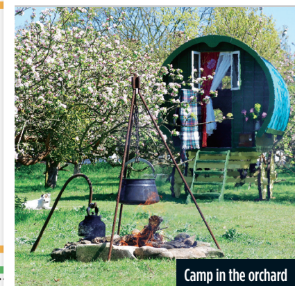
Camp in the orchard

Bouncers Farm, Essex Part of the Maldon Art Trail, a Gypsy camp is recreated at the edge of an orchard and rare Kune Kune pigs range free. Food hampers can be delivered and there's a wood burner too. COST A three-night break costs £345 for four. 01275 395447, canopyandstars.co.uk/find-a-place/bouncers-farm