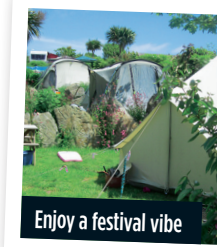
Enjoy a festival vibe

Henry's Campsite, The Lizard, Cornwall Pitch your tent then enjoy the wonderful array of wild, cultivated and exotic plants, rescued animals and local art. This site has a summer festival feel and hosts its own mini-fest of acoustic music from 21-24 September. COST £9.60 per adult, £4.80 per child and £3 for electric hook-ups. All prices are per night. 01326 290596, henryscampsite.co.uk