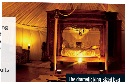
The dramatic king-sized bed

Lincoln Yurts, Lincolnshire For something way out, check out the themed yurts at an equestrian centre in the Lincolnshire countryside. Hand built in Mongolia, we love the Gothic Yurt with its king-sized vampire bed. Very Twilight ! COST Two nights from £165 for two adults and up to three children. 07429 371702, lincolnyurts.com