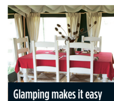
Glamping makes it easy

Mill Farm, Wiltshire These new canvas lodges offer luxury camping with stylish living areas, a stove and wood burning fire, a master bedroom, second twin or double, kids bunk beds and even flushing toilets and hot showers. COST From £600 per week, 01380 828351, millfarmglamping.co.uk