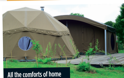
All the comforts of home

Durrell Wildlife Camp, Jersey Guests stay in geodesic dome-shaped semi-permanent tents with a kitchen, real beds, showers, WC and cooking facilities. The communal area - Lemur Lodge - overlooks 'lemur lake' exhibit, a natural valley home to species such as lemurs. And across 'Camellia Walk' you'll see native birds, as well as marmosets, tamarins and storks. COST Two adults and two children from £325 for three nights. 01534 860090, durrell.org/camp