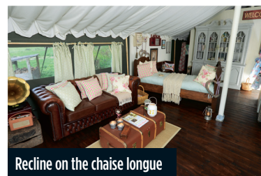
Recline on the chaise longue

Set on a Leicestershire goat farm, Bluebells tent at Dandelion Hideaway is tucked away from five others (all family orientated) and full of romantic touches such as a chaise longue and candlelit roll-top bath. COST Three-night weekend breaks from £389 for two, including goodies and wood for the stove and campfires. 01455 292888, thedandelionhideaway.co.uk