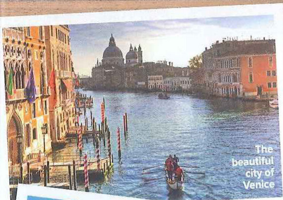
The beautiful city of Venice