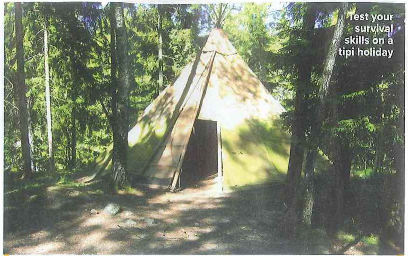
Test your survival skills on a tipi holiday

Indulge in your favourite activity or learn a new one. Whether you're a family, a couple, an empty nester, a solo traveller or taking a break with your best friend, there's a holiday to suit you